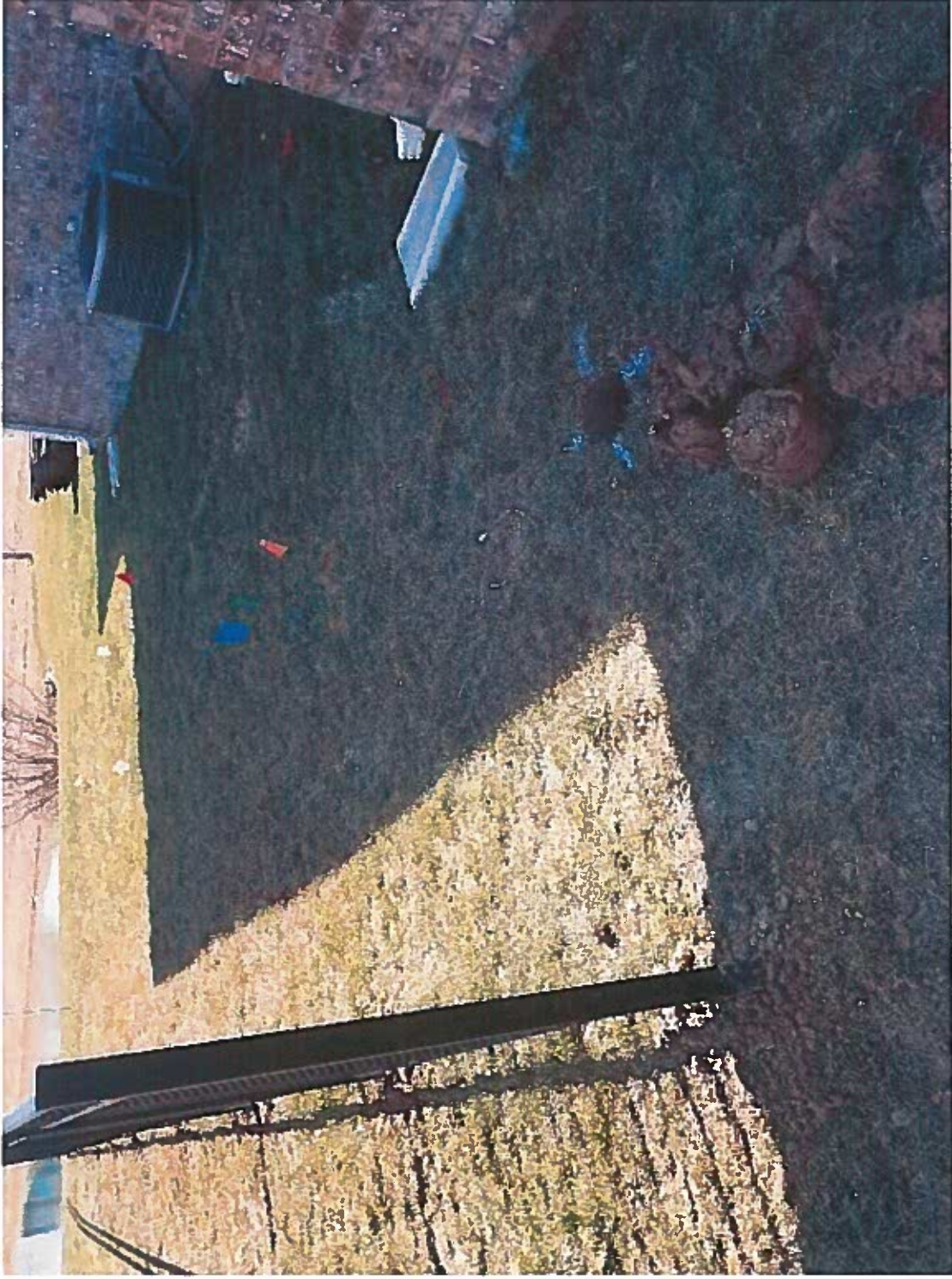
Property of United States Infrastructure Corporation Photo created on 04/02/2019 15:02:43 PM EDT